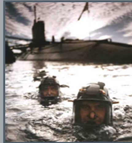
Northern Diving Group – circa 100 Sailors