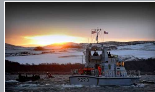
1 st Patrol Boat Squadron – 2 ships: circa 100 Sailors