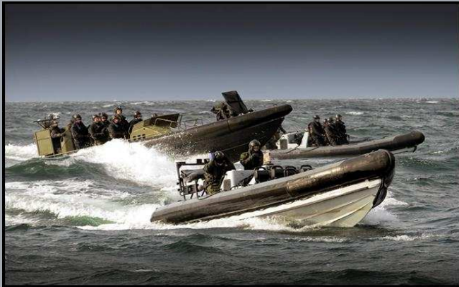
Fleet Protection Group Royal Marines – circa 1,000 Marines