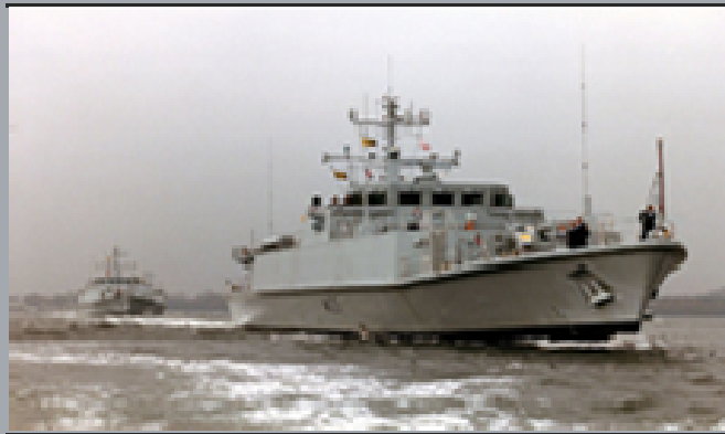
1 ST Mine Counter Measures Squadron – 7 Ships: circa 500 Sailors